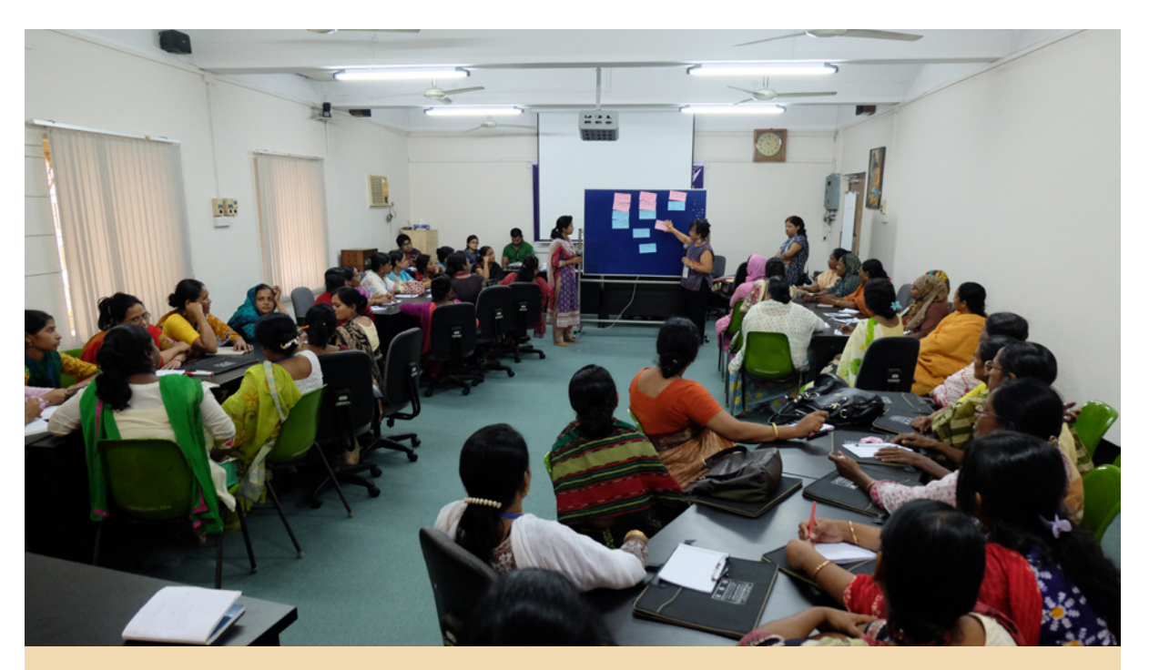
A domestic workers training of trainers workshop in Dhaka in 2014, organized by the ILO, IDWF and NDWWU.

Domestic workers also turn to the largely unregulated private sector (including pharmacies, NGO-backed clinics or village doctors) when they need urgent health care, due to unavailability or long waiting times in public facilities. This may expose them to unscrupulous practices – such as ordering unnecessary tests – which add to costs (Islam Interview, November 2019). Tests were cited as a major health-care cost, with 34 per cent of workers reporting that they had spent BDT4,000 (USD47) or more on tests during their last health-care visit.