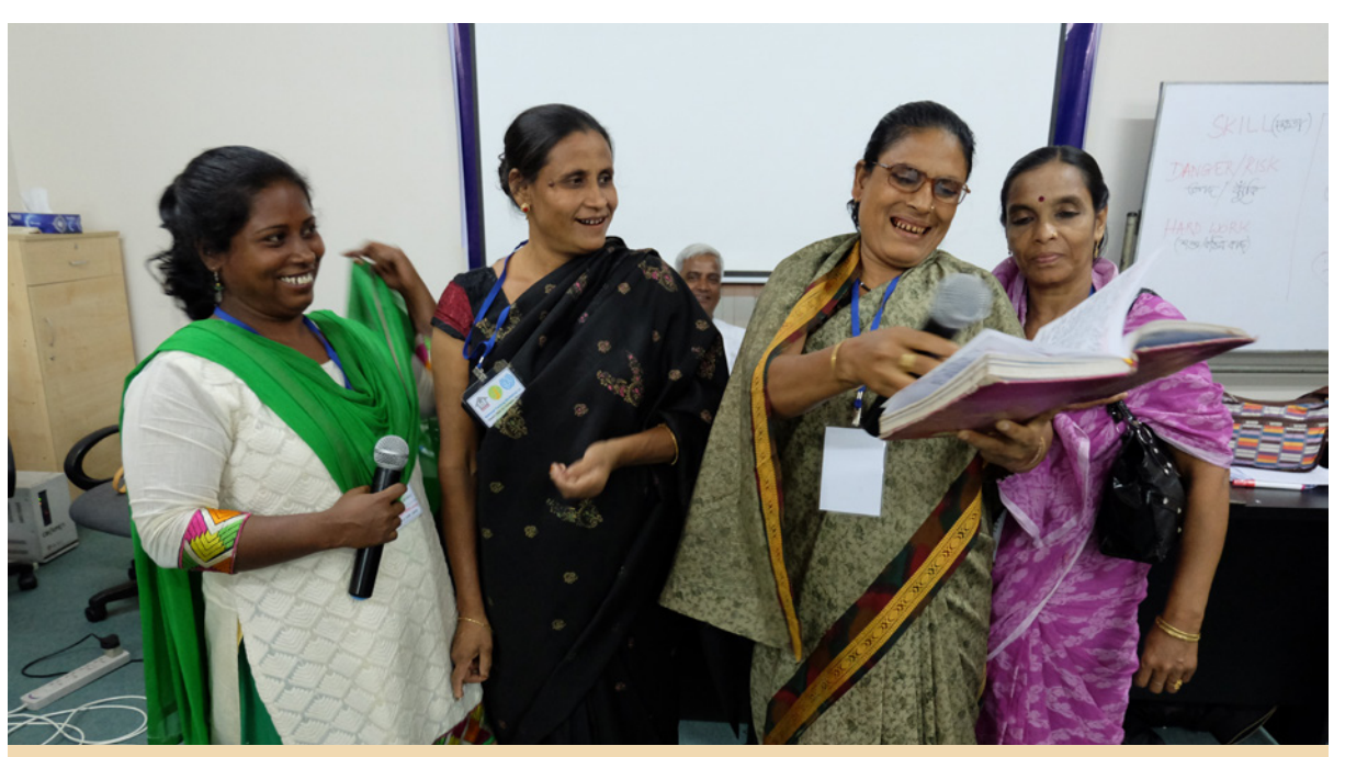
Domestic workers at a training of trainers workshop in Dhaka in 2014, organized by the ILO, IDWF and NDWWU.