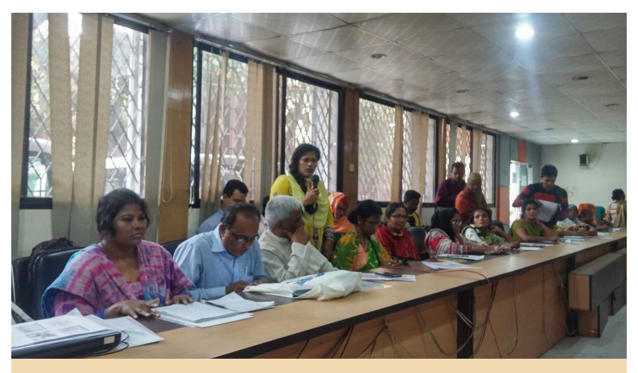
Union members at a NDWWU-IDWF seminar on protecting the rights of Bangladeshi migrant domestic workers.

Individual: The majority (86 per cent) of the survey participants were aged 30