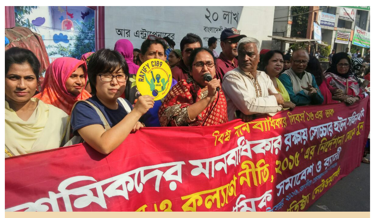
NDWWU members on the rally of Human Rights Day, Dec 10.

"Previously, we used to be restricted from joining any such union from our families. My husband used to beat me... but now he realizes that he cannot do this to me because I have become much more aware of my rights. If we'd get late while returning home from attending union meetings, we had to hear so many